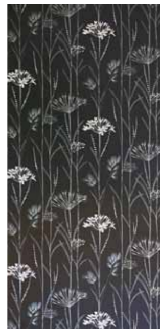
Gardinum wallpaper in 110556, £59 per roll, from the Poetica collection at Harlequin