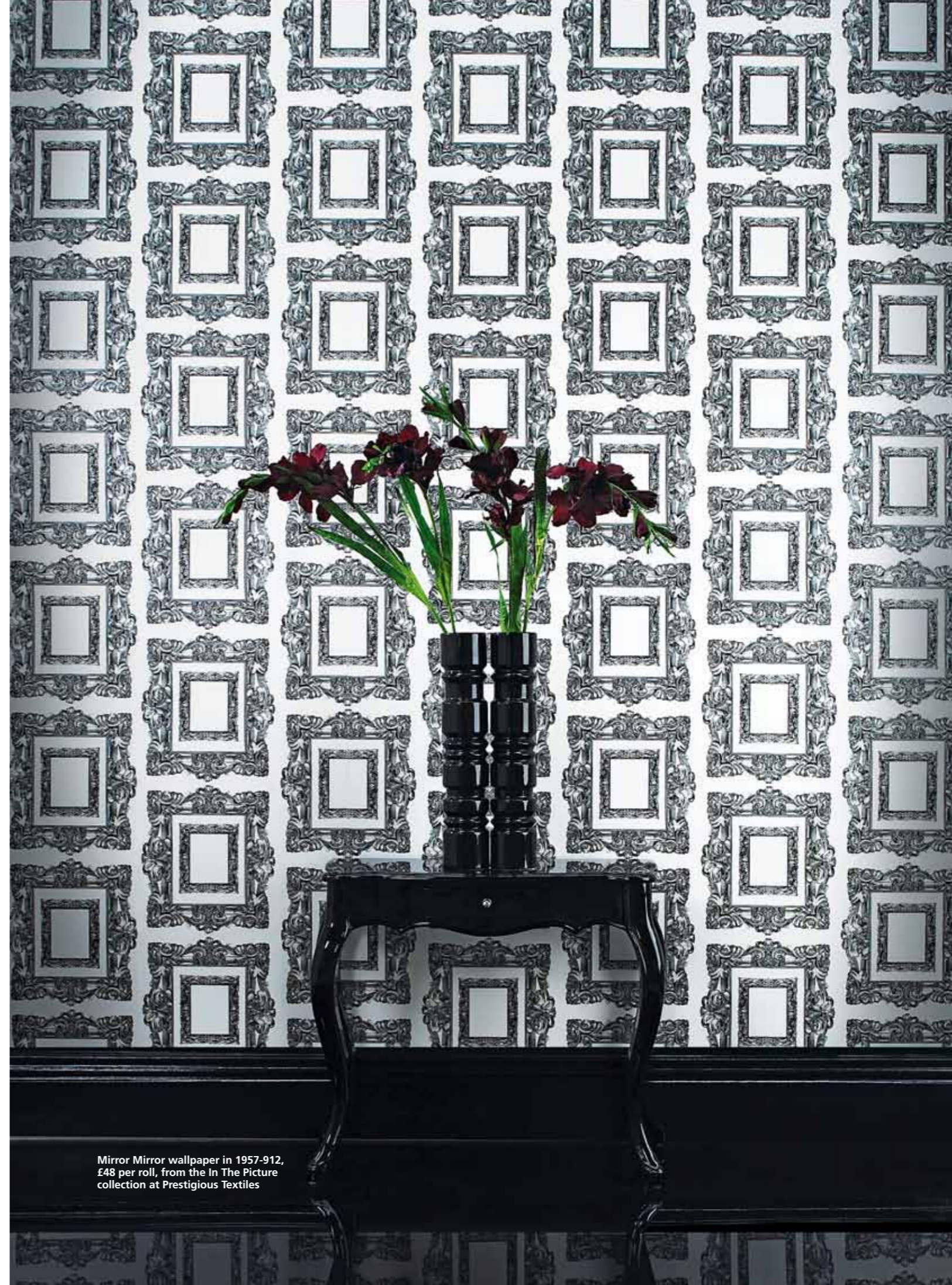
Mirror Mirror wallpaper in 1957-912, £48 per roll, from the In The Picture collection at Prestigious Textiles