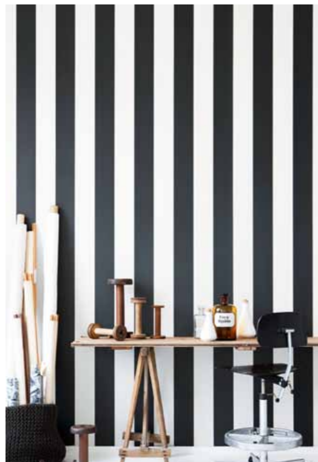
Ferm Living Vertigo wallpaper, £68 per roll, Cloudberry Living