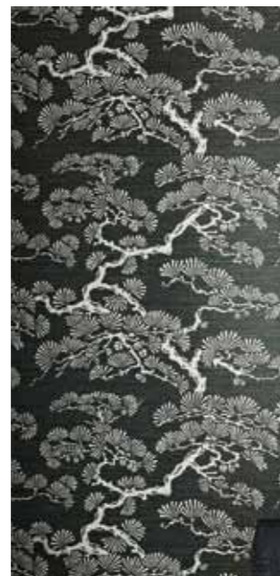
Keros wallpaper in Ebony, £49 per roll, Sanderson