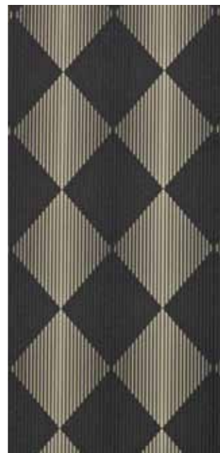
Pavé wallpaper in W6437-01, £76 per roll, from the Osborne & Little Cabochon collection at Amity